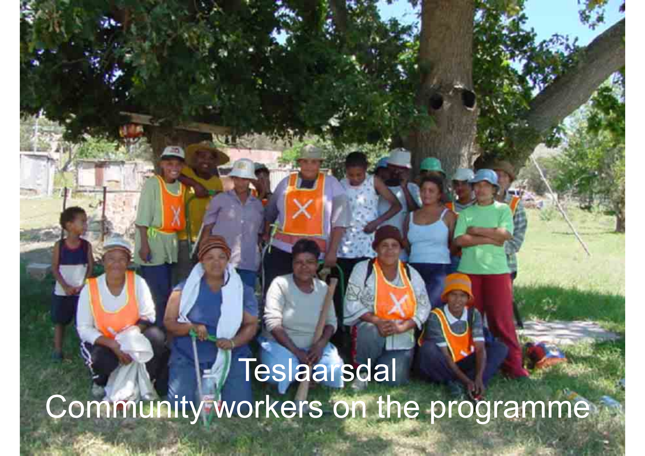
Teslaarsdal Community workers on the programme